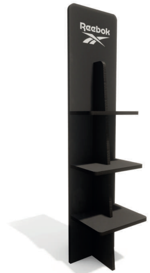
LOGO STAND RBSTAND Ecofriendly Display Dimensions: 36 cm x 146 cm x 6 cm