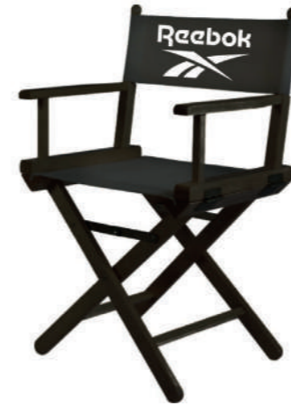
LOGO CHAIR RBCHAIR Dimensions: 49 cm x 72 cm x 34 cm