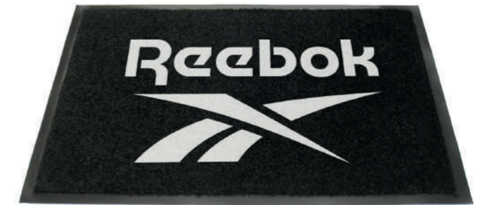
LOGO MAT RBMAT Dimensions: 60 cm x 90 cm